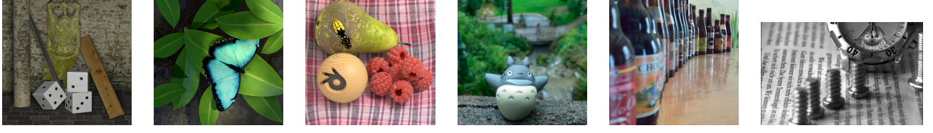
Fig. 1: Light Fields used in the tests: Synthetic (three left images called Buddha, Butterfly, StillLife) and Real Light Fields (TotoroWaterfall and Beers captured by a Lytro camera) and Watch captured by a Raytrix camera.

compression (i.e. quantization) errors on the light field reconstruction, the matrix C is recalculated to account for these quantization errors, as follows: